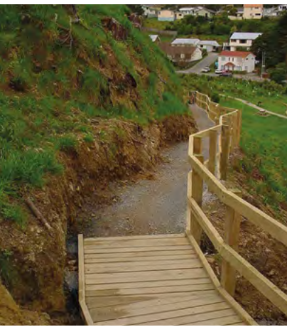
The carpark area has vastly improved since these early days with over 10 years planting and releasing.