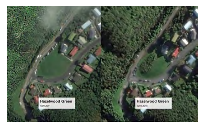
We continue developing the area at the corner of Hazelwood Ave and South Karori Rd into a beautiful patch of native forest. We started this year's planting season in this area with seedlings provided by the WCC and Forest & Bird.