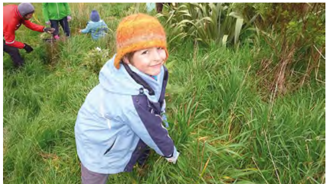
KATCH-22 is the 'pest control arm' of Makara Peak Supporters. With close to 50 volunteers, it is one of the largest pest control groups in the Wellington region – covering Makara Peak, Wrights Hill (Salvation/Deliverance), Birdwood Reserve, Karori Park and Skyline to Johnston Hill.

We would like to say a big thank you to WCC and local volunteers who have supplied new traps which KATCH-22 volunteers have been able to introduce on Wrights Hill through to the Deliverance area. This intensive trapping of pests helps to create a safer corridor between Zealandia and Makara Peak, which in turn helps with the return of Korimako (Bellbird) around Karori Stream. The volunteers have also introduced traps to Johnston Hill to complete the encircling of Karori and closing the gap to Otari/Wilton's Bush.